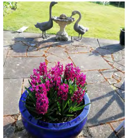
'Gert & Daisy' with hyacinths