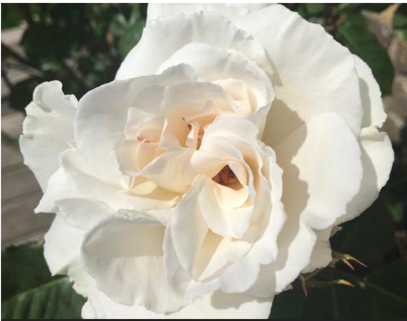
'Margaret Merrill' Rose best scent in the world!