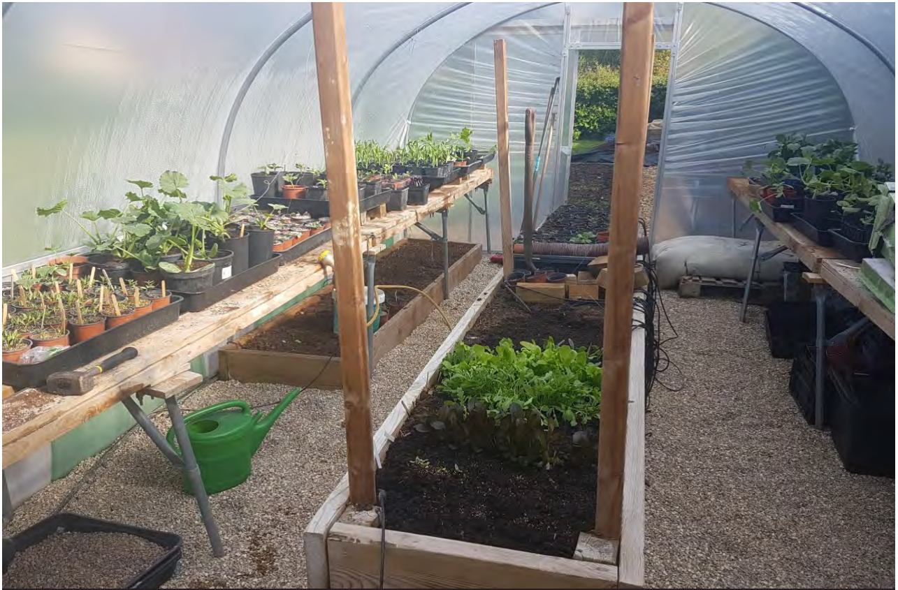
Polytunnel getting fuller