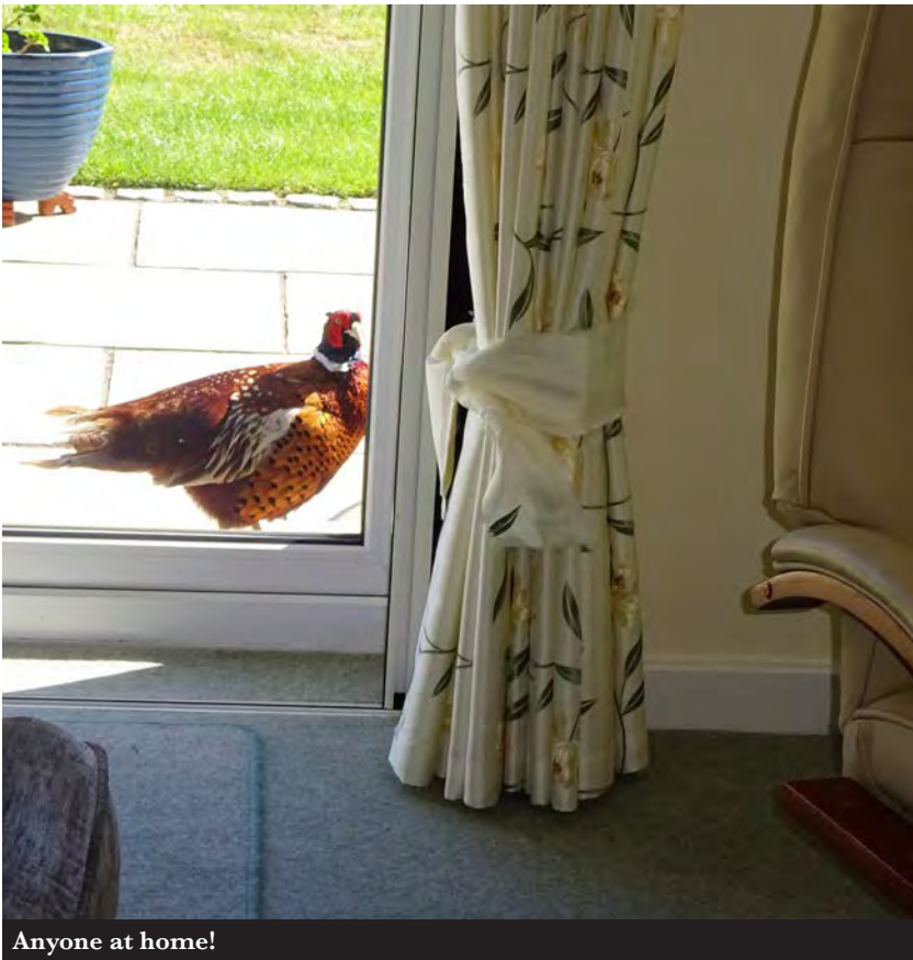
Anyone at home!