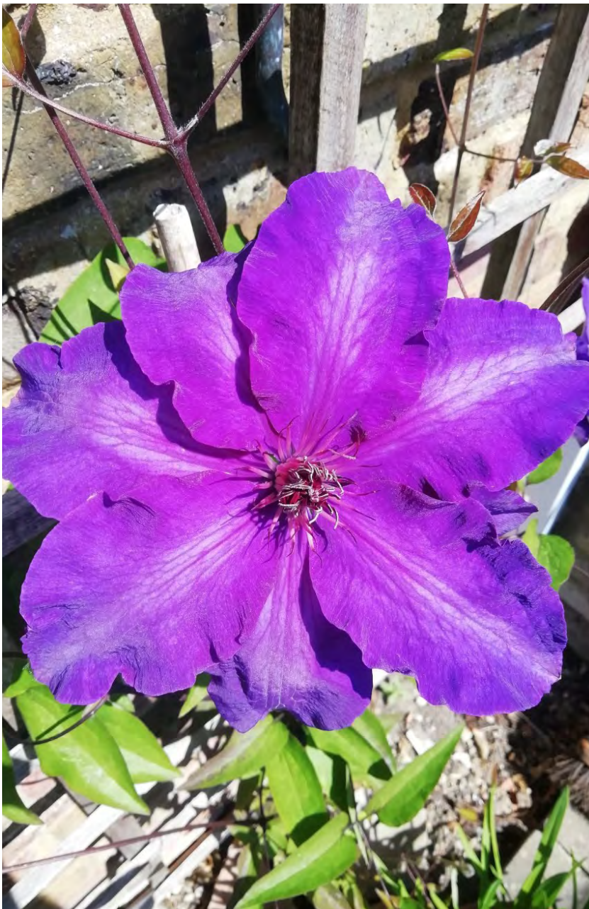
Beautiful Clematis 'The President'