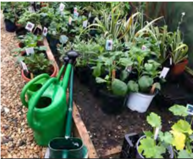
Lots of plants waiting to be planted out at the end of this week