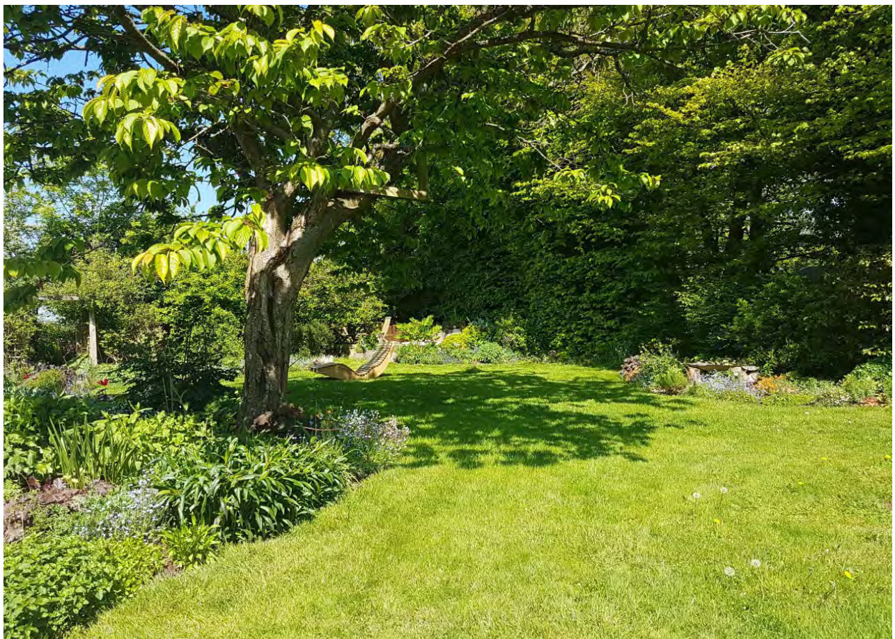
The sun makes a garden