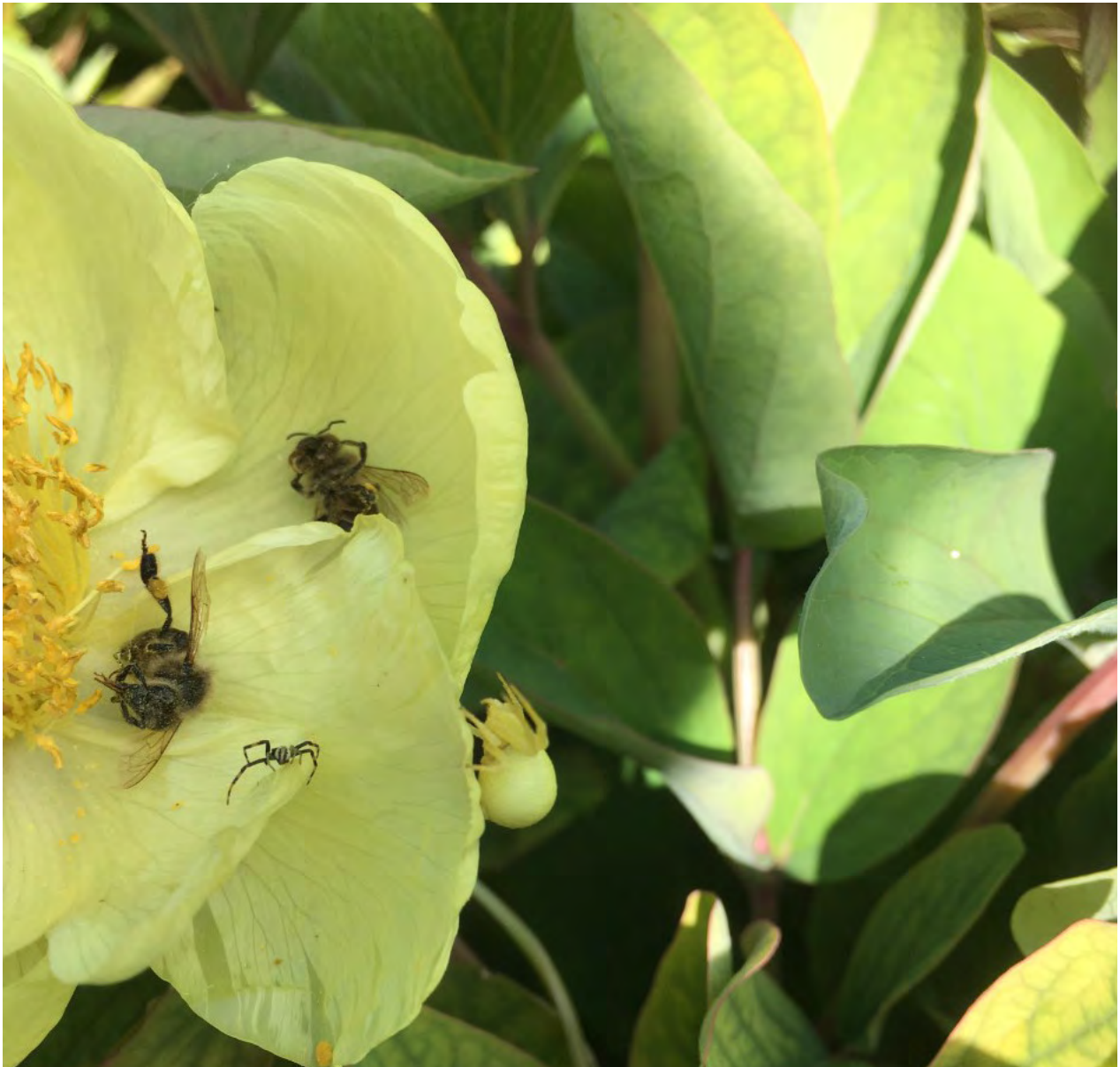
The Peony and the spider

I thought I would have a look at our yellow peony the other day, it has three days of glory every year and the rest of the time it doesn't do a thing. I was surprised to see a dead honey bee lying inside one of the flowers, closer inspection showed something sinister going on, as I touched the flower an amazing spider appeared in exactly the same livery as the flower, it matched exactly the somewhat citrus yellow of the flower. I watched fascinated as it hid beneath a petal and another bee appeared, in a flash the spider appeared and attacked the bee, obviously biting it with venom and in no time the bee was paralysed, whereupon the spider spent a happy 10 minutes sucking it's juices.