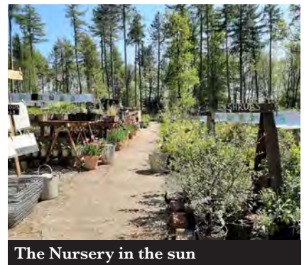
The Nursery in the sun