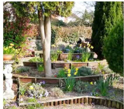
Corner of our rockery by the pond