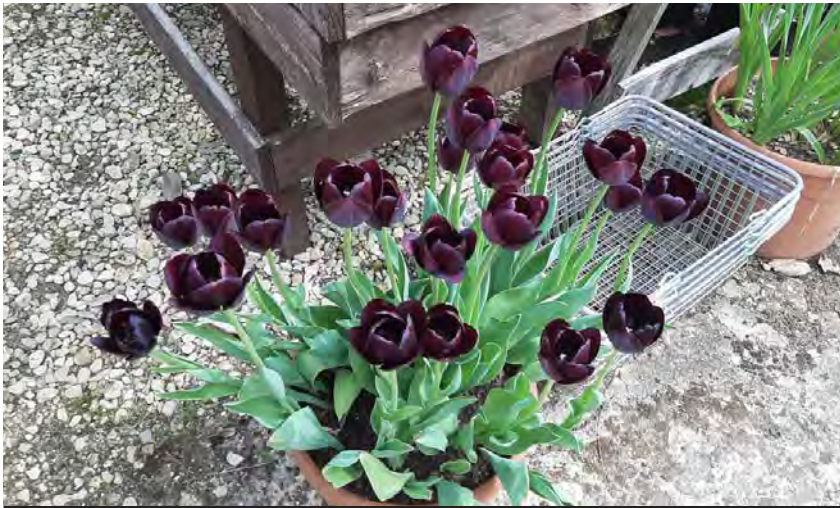
Tulip 'Queen of the Night'