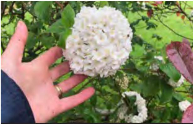
Viburnum calcephalum, first flowers opening in April (my favourite scented shrub in our garden)