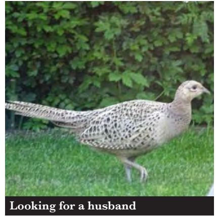
Looking for a husband