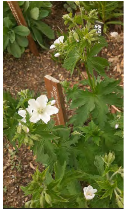
Geranium Sylvaticum 'Album'