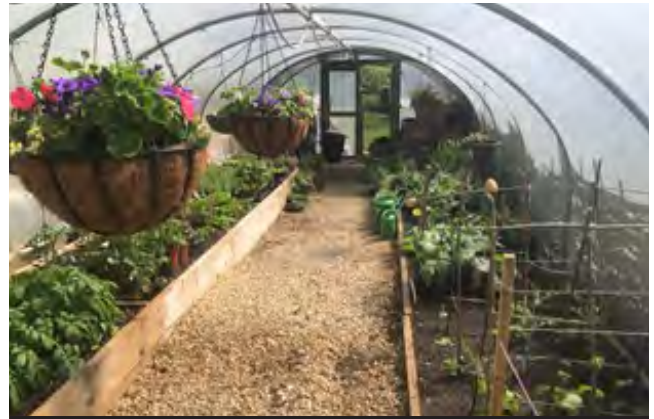
Inside the polytunnel